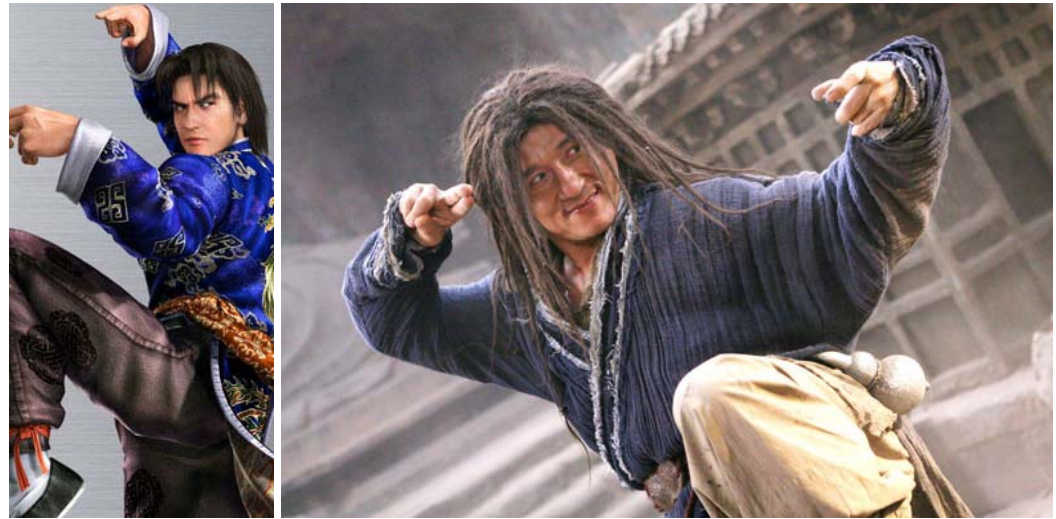
Similar martial art between Lei Wulong and Jackie Chan