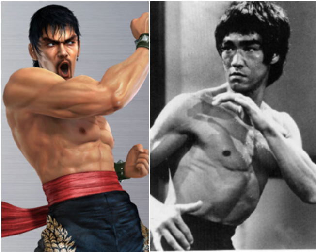
Similar martial art between Marshall Law and Bruce Lee

People would like to learn martial arts techniques like Bruce Lee, Jackie Chan and Tekken characters!